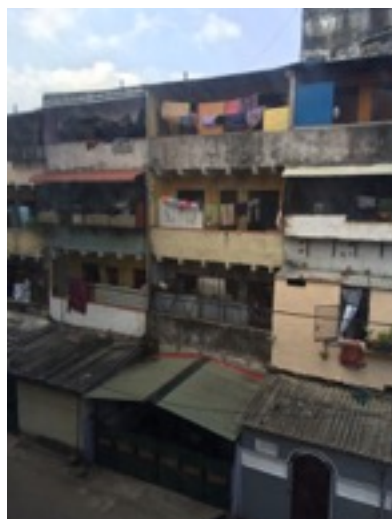
The buildings across from ours

Trip to Sri Lanka Monday March 14, 2016 Day Four